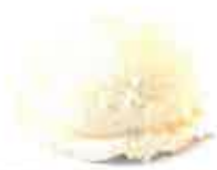
Plain vanilla ice-cream 1 large scoop