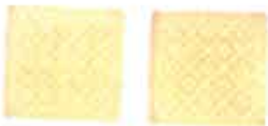
2 Rich tea or malted milk biscuits