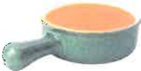
Tomato soup 200 gram (half a large tin)